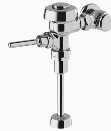
Variation Not Shown: Ground Joint