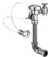
REGAL 9603 XL