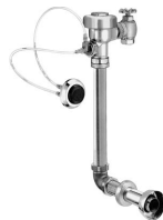
REGAL 940-1.6 XL