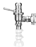
DOLPHIN TYPE 1 CLASS A

**Contact Your Local Sloan Representative