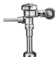
REGAL 180 XL

**Contact Your Local Sloan Representative