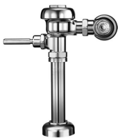
REGAL 111 XL