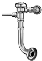
REGAL 120 XL