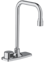
EBF-775 Deck mount, battery ETF-770 Deck mount, hardwired