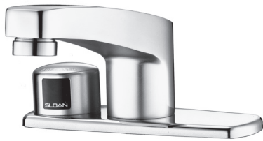
EBF-665 Deck mount, battery ETF-660 Deck mount, hardwired