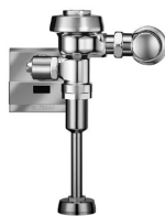
ROYAL 186 ES-S