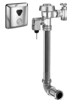
ROYAL 152 ES-SM

**Contact Your Local Sloan Representative