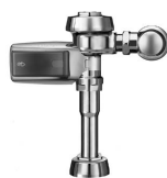
ROYAL 180 SMOOTH