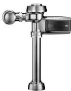
ROYAL 111 SMOOTH