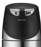
SOLIS DF RESS