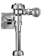
ROYAL 180 ES-S

For "L" Dimension longer than 12-3/4", add 5.30 per inch.