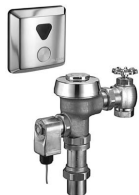
ROYAL 150 ES-SM