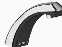
Variation not shown: 4" Trim Plate