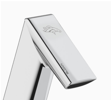
Logo artwork example

Logo artwork should be placed in the upper portion of the faucet crown.