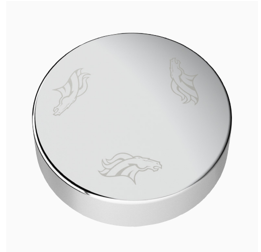
Logo artwork example

Logo artwork will be placed at a 120° angle.