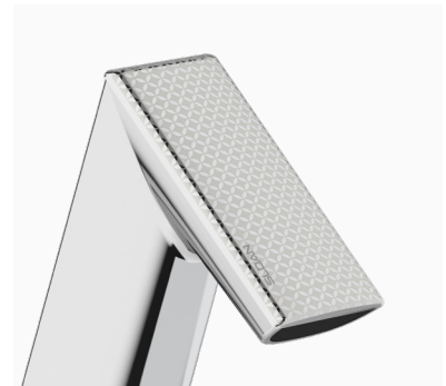
Pattern artwork example

Patterned artwork can fill the entire crown surface area. The area around the Sloan logo mark is excluded.