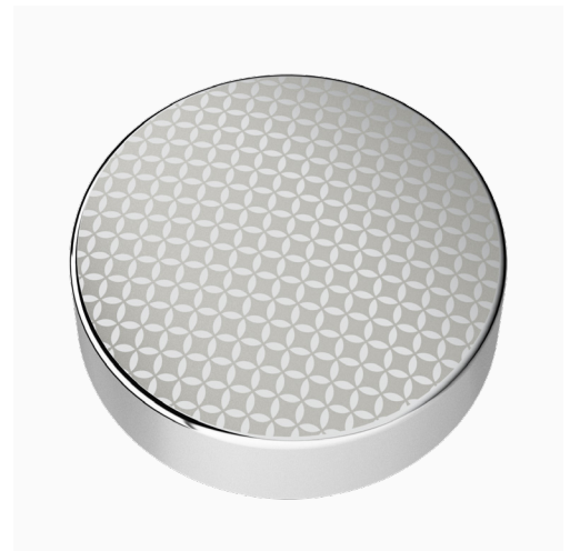
Pattern/graphic artwork example

Pattern and graphic artwork can fill the entire cover surface area.