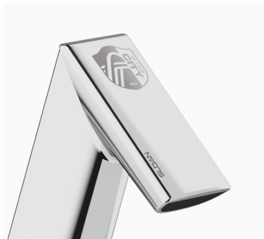
Graphic artwork example

Image or graphic artwork can use up a greater portion of the crown surface area.