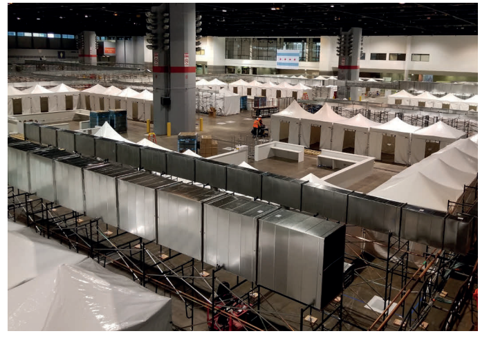
With the cooperation of vendors like Ferguson, Bradford White, Laars, and Sloan, Helm Group (formerly Mechanical, Inc.) and others had the first 500 beds ready to go for COVID-19 patients in a Chicago field hospital set up in McCormick Place convention center.

"We didn't know what to expect, when we got the call to help on the COVID-19 Care Center project at McCormick Place,"