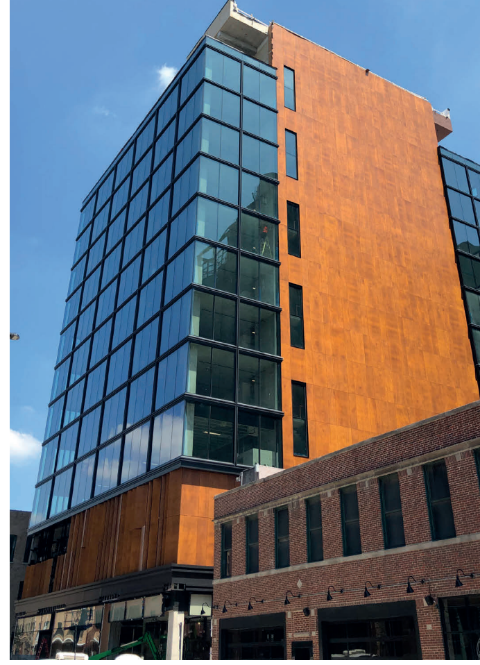
Situated in a historic Chicago neighborhood, Fulton East is the nation's first office building designed specifically to address employee health, safety, and wellness in a post-COVID-19 business environment—thanks in part to Sloan's touch-free commercial plumbing systems.

The project specified Sloan's vitreous china Designer Urinal and wall-mounted water closet, each paired with a Sloan SOLIS<sup>®</sup> solar-powered and sensor-operated flushometer to deliver an energy-efficient and clean flush complemented by touch-free technology.